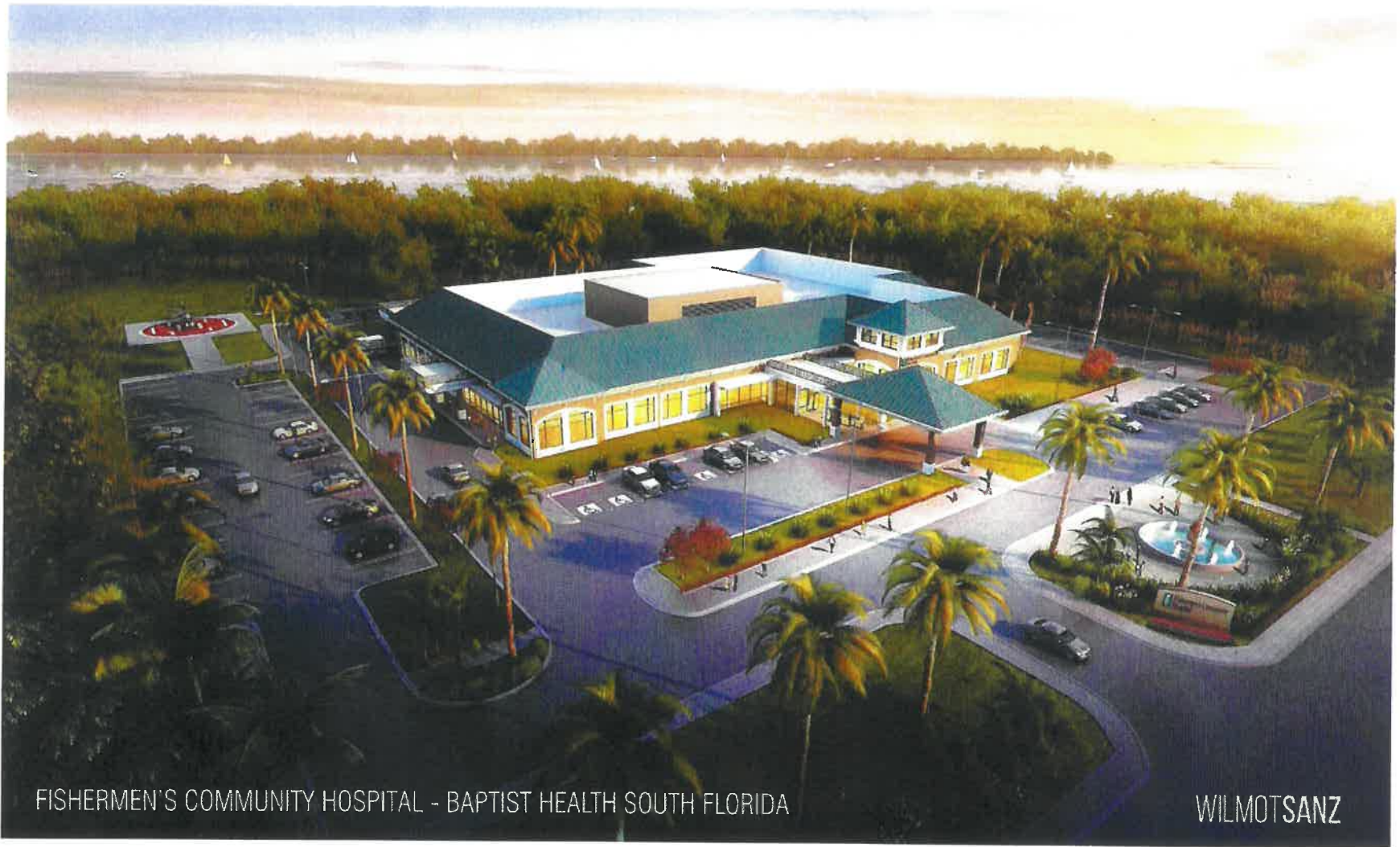
FISHERMEN'S COMMUNITY HOSPITAL - BAPTIST HEALTH SOUTH FLORIDA